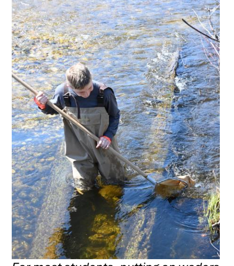
For most students, putting on waders and using nets to collect invertebrates while studying water quality is an entirely new and exciting experience.

Through the years, students have explored a wide variety of careers through immersive, interactive experiences. They've participated in on-site archaeological digs, and worked alongside a veterinarian, taking a horse's temperature. They have acted as forensic scientists, dusting for fingerprints and casting footprints. Students have also practiced clearing airways with an emergency medical technician, donned waders to collect macroinvertebrates in Deer Creek, and conducted population studies at Raven Hill Pond. Not only are the students energized by these opportunities, but the professionals who present these hands-on experiences also express excitement & gratitude. These experts love sharing their career paths, promoting their professions, and rediscovering the passion behind their work. For many presenters, it's a refreshing break from the daily routine—a chance to inspire the next generation & reconnect with the beauty of their own dreams.