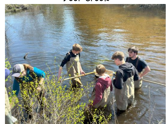
At Deer Creek, the water quality career session offers a unique and interactive opportunity to step into the role of a biologist. Each hands-on activity immerses them in the real-world work of environmental scientists. It's more than just science—it's an adventure that combines discovery, teamwork, and the chance to make an impact, all while sparking curiosity about STEM careers.