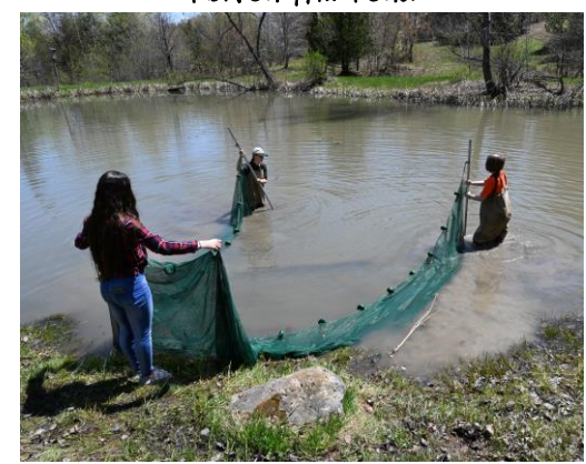
Raven Hill Pond provides one ideal site for hands-on population studies, offering students the chance to observe and analyze local aquatic ecosystems.

hands-on career exploration opportunities, expanding to include boys in 1995. Over the past 30 years for girls and 28 years for boys, these expos evolved from separate days and career tracks to inclusive, mixed-gender groups in recent years. Since its inception, the program has impacted 4,417 middle school students, offering them engaging, hands-on experiences to explore math, science & technology careers.