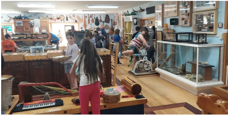
Maximalism is everywhere at Raven Hill, especially in the hands-on Discovery Room, the Evolving Technology Building and everywhere in between! It encourages visitors to discover, explore and be curious.