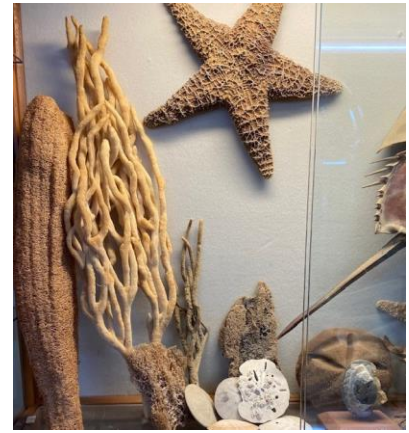
This display of sea creatures also includes a plant and a fossil, making it a mini-maximalist exhibit! Can you pick out the plant and the fossil?

Raven Hill's maximalist approach creates spaces where learning is multifaceted, offering visitors a rich and varied experience that continually inspires discovery and curiosity. The Center fosters connections with and between science, history and art. No matter what a visitor's interest, they will connect with something at Raven Hill. By continually enhancing the museum's environment, the Center designs immersive experiences that encourage visitors to learn, grow, and play. This "more is more" philosophy encourages variety, detail, and engagement in every nook and cranny at Raven Hill. Guests are encouraged to look up, down and all around wherever they find themselves at the Center! The Evolving Technology Building will be an additional example of maximalism with its new door, window and "How We Got to Now" timelines on the foundational bases there.