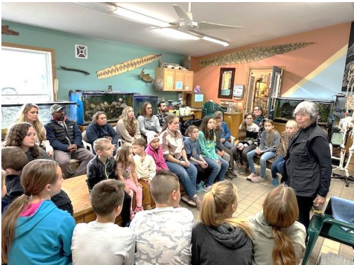
It's always a full house, when you have almost as many drivers as students, but they all enjoy the animal session!