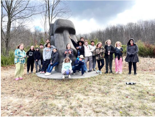
The Moai continues to be a favorite part of the Ancient World even for middle school students!

Raven Hill is more than a nature center, although its outdoor spaces, trails, and hands-on environmental exhibits help students develop an appreciation for the natural world, inspiring stewardship and curiosity about the environment. The interactive and exciting environment fosters a greater love of learning in general, encouraging students to explore topics they may not have encountered or fully understood in a traditional classroom. Field trips give students the maximum opportunity to experience the joy of discovery, deepen their understanding, and apply what they've learned in a memorable and meaningful way.