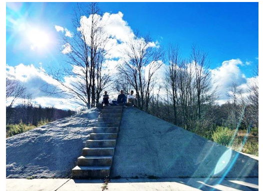
Sometimes a place like the pyramid is even more special when you catch an unforgettable photo like this one! Thank you, parents & teachers for sharing memories.