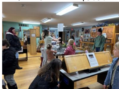
Today’s visitors were almost equally divided between youngsters & oldsters—32 children & 31 adults!