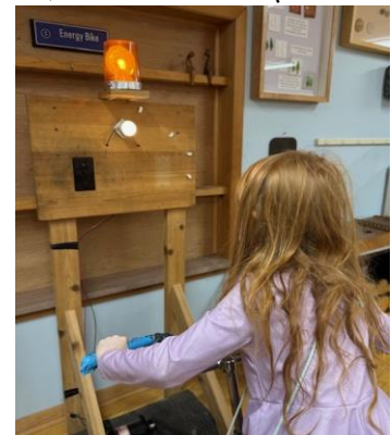
The generator bike is a hit with the kids! It’s a fun way to spark curiosity about science & energy.