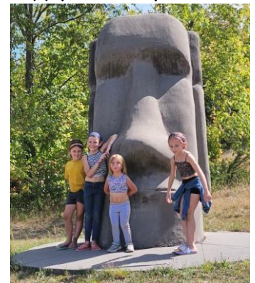
Look for your birthday invitation coming soon and help us celebrate DumDum’s 25th!