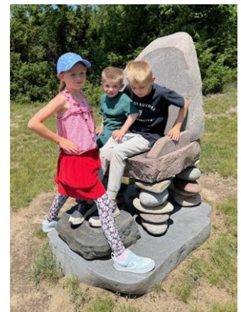
Play class at the Stone Throne

At Raven Hill, every season brings new chances to be curious, creative and make new connections. Whether you're celebrating DumDum, capturing a portrait, crafting a clay whistle, building a 3-D printer OR just visiting with family to explore, there's a place for you here. Come join us on the journey. Raven Hill is open weekdays from 10am to 4pm, Saturdays from noon to 4pm and Sundays from 2pm to 4pm.