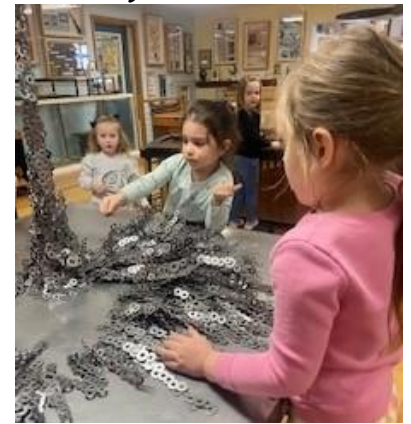
Field trip HERE