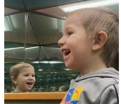
Field trip HERE