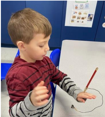
Outreach THERE in the classroom

Each experience serves a distinct purpose. Field trips leverage interdisciplinary learning opportunities thru Raven Hill's exhibits, facilities and hands-on activities that connect science, history and the arts. Students engage with sensory-rich environments that create immersive experiences deepening visitor understanding. Outreach programs bring Raven Hill's interactive, hands-on experiences directly into classrooms, extending the Center's educational influence beyond its physical location and introducing Raven Hill to a broader audience. Both formats—field trips and outreach—ignite curiosity and foster critical thinking, encouraging self-guided discovery and interactive learning that inspire students to explore the world around them.