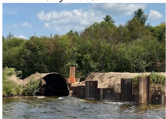
Work on the south side of the culvert will be completed and then the focus will shift to the north side. The old culvert is slated to be removed on or about October 1<sup>st</sup>.

Connecting—The Fuller Road Bridge will soon span Deer Creek and connect the north and south sides of Fuller Road, offering a safe crossing for visitors on their way to explore all that Raven Hill has to offer. Raven Hill creates bridges between different fields of knowledge—science, history and art—helping visitors see the interconnectedness of these subjects. By offering exhibits and programs that blend these areas, the Center encourages an integrated approach to learning.