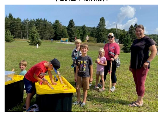
Wednesday was the last day of the SACK (SUMMER ADVENTURE CLASSES FOR KIDS) Program. Everyone had a great time exploring the Pop-up Museum, seeing the animals, as well as making and launching foam rockets at the Open Space.