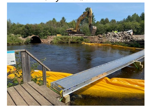
A yellow boom is in place downstream of the bridge site to catch sediment and protect the waterway. Construction is expected to continue over the next four months or so.