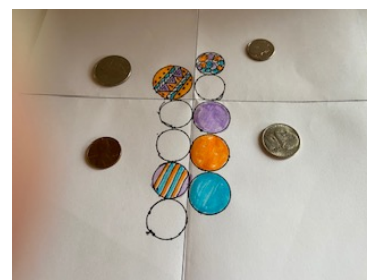
3. Color the circles all different!

Enjoy and be sure to put all your supplies away, when you are done.