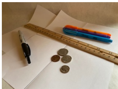
1. Get supplies.

Find a quarter, dime, nickel and penny. Fold a piece of paper into fourths and use a ruler to draw the fold lines. Draw around the coins and fill each part with circles of quarter size in one, dime size circles in the second, nickels in the third and pennies in the fourth section. Predict how many coins/circles will fit in each part! Count the number of quarters, dimes, nickels and pennies. How many of each? Which part has the most circles? Which part has the least? How much money is in each part, that is how much total money in quarters, how much in dimes, etc.? Now find some markers or crayons or colored pencils or even different pens and pencils. Use your creativity to color in each circle. Make some look like Easter eggs! If you get tired of coloring, put your supplies away and come back to work on your drawing another time!