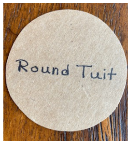
3 Label as Tuit or Round Tuit