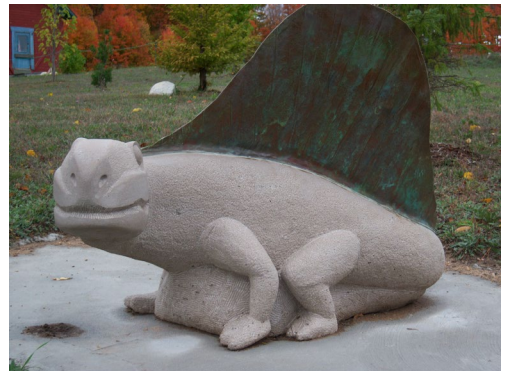
Dimetrodons are another of our prehistoric ancestors, more closely related to mammals than dinosaurs. They may have used their large dorsal fins to absorb heat, but more likely used it in courtship displays! Jim cast a bronze fin for this limestone carnivore.