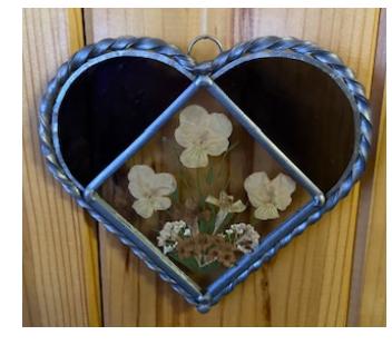
Stained glass and pressed flowers combine to fashion a beautiful heart.

Promoting natural resource conservation in Charlevoix County through partnerships, community outreach and landowner support, since 1948.