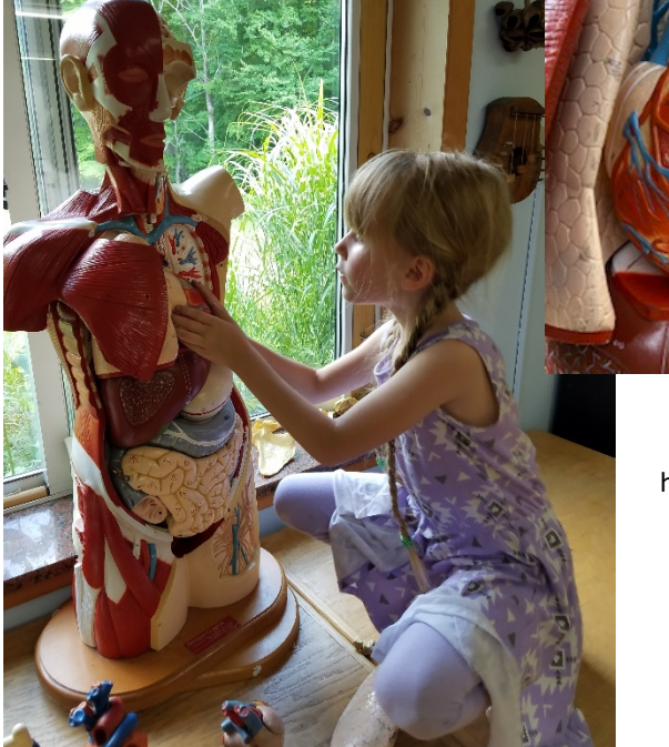
This spring, inside exhibits will be a one-way walk through, just for looking and learning. For visitor safety during the pandemic, the only

For visitor safety during the pandemic, the only interactive exhibits at Raven Hill will be outside!