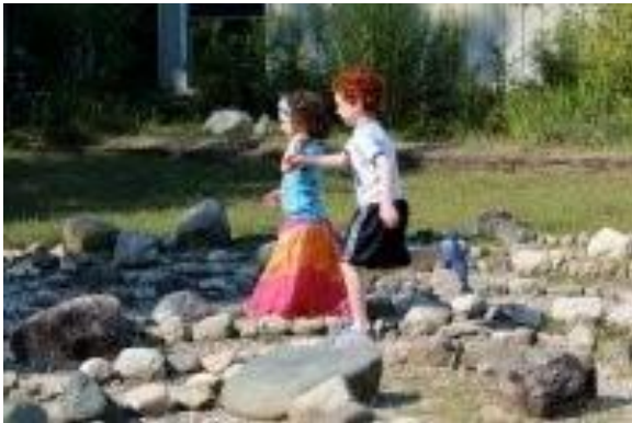
Raven Hill's existing "kid built" labyrinth.

Meet us in Raven Hill's Ancient World to celebrate the Summer Solstice AND participate in the creation of a new labyrinth. Everyone is invited and those interested in becoming Labyrinth Builders are encouraged to donate one or more 10 to 12-inch diameter rocks, which will be used collectively to construct a labyrinth in the Ancient World at Raven Hill. This collaborative event emphasizes community involvement, creativity, plus it is a shared effort to create a symbolic and meditative structure.