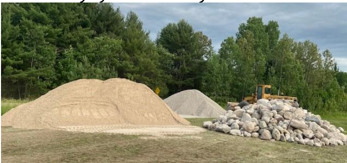
Staging area for bridge construction

The bridge construction company is currently stockpiling supplies in anticipation of the bridge replacement! Note: no pilfering rocks for Raven Hill's Labyrinth project, however tempting that may be!