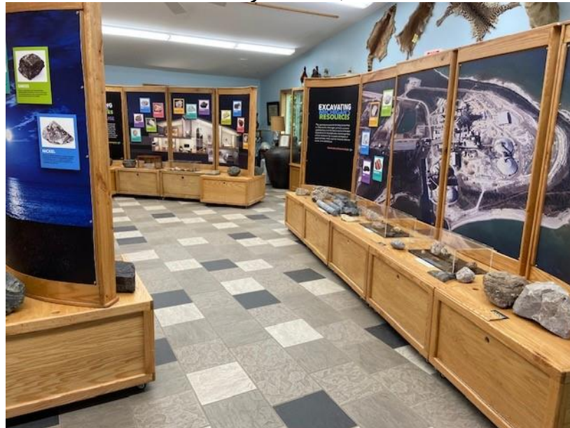
Under Michigan & Beyond exhibit

Raven Hill's Under Michigan & Beyond exhibit facilitates visitor understanding of Michigan & Earth resources, how they are extracted and then used in our daily lives.