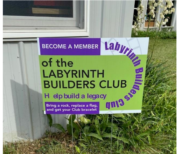
Labyrinth Builders Club

Bring a rock, replace a flag and get your Club bracelet!