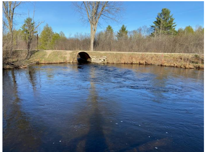
Deer Creek at Fuller Road

Imagine a beautiful timber bridge on Fuller Road to replace the old culvert and restore Deer Creek to its natural state.