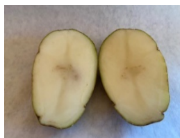
3 Observe the inside