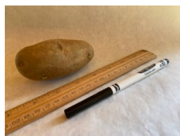
1 Get supplies