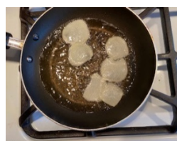
4 Slice & fry in oil