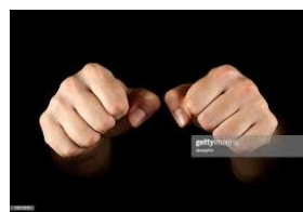
4. Other person guesses & winner gets next turn.