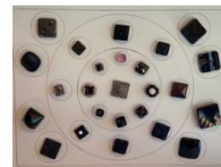
Old black glass buttons

Keep your favorite object in a safe place for future games. Enjoy and be sure to put all your supplies away, when you are done.