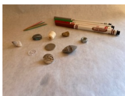
1 Gather supplies

Note: Start saving empty boxes, paper towel and TP rolls for a "robot".