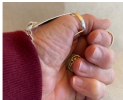
3. Hide object in fist.