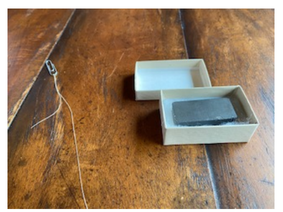
4 Magnet in box