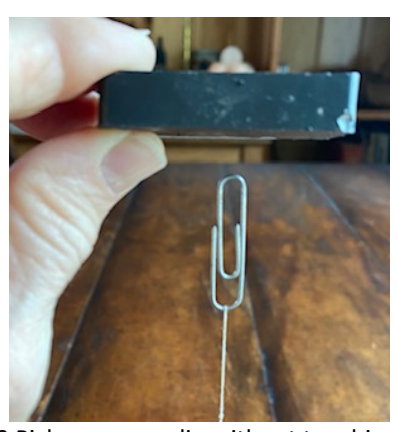
3 Pick up paper clip without touching