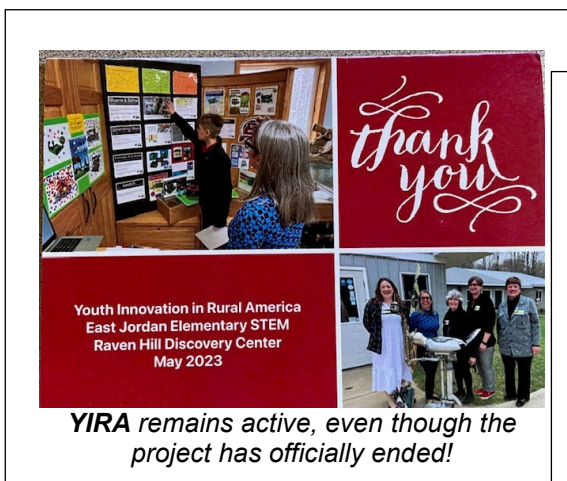
YIRA remains active, even though the project has officially ended!