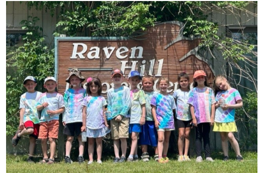
Bishop Baraga "1 st Grade Crew" showed off their beautiful tie-dyed t-shirts during their visit to Raven Hill this week! They witnessed the release of "Ralph", the snapping turtle, into its new home at Raven Hill Pond. Ralph promptly buried itself in the mud and disappeared from sight!

Staff split their week between helping with field trips, preparing for summer classes and helping with the newest learning station along the