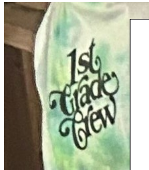
Nobody got lost with these great t-shirts!