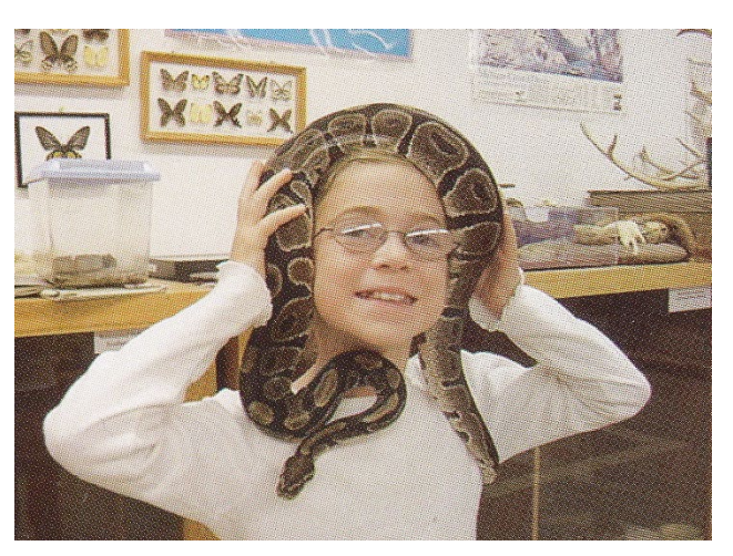
Leroy, the royal python, was comfortable hanging out most anywhere, including being a unique kind of head gear.