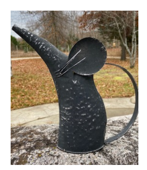
To most of us, a mouseshaped watering can is much cuter than the real thing!

Our thanks go out to Eddie & Pat May for their biweekly mouse runs. The animals are always happy to see their big red truck drive in! They've never been so well fed!