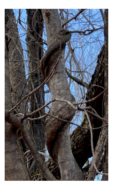
Michigan "strangler" vine, at Raven Hill's Ancient World—a close up look at the tree in the picture to the right.

Strangler figs are native to Florida and other tropical & subtropical areas. They strangle their host tree, growing down into the roots and robbing their host of water and nutrients, as well as growing up to reach the sunlight above the tree canopy. Photo by Tim Leach, 1971, Key West, FL