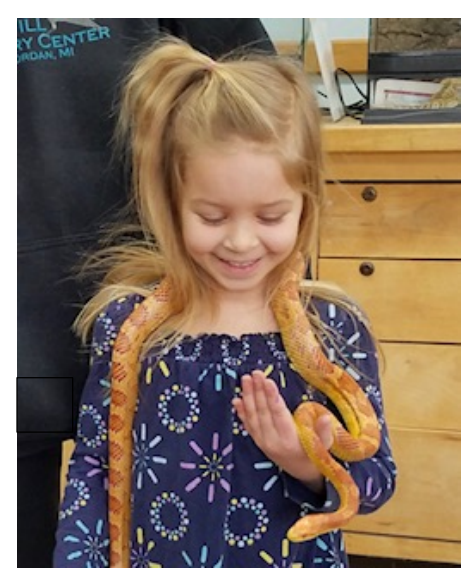
Checkers, the corn snake, only strangles mice for his lunch or dinner. Our current Checkers should more correctly be called "Checkers the Eighth", as all of our corn snakes are named Checkers.

Speaking of creeping and crawling and even strangling (mice), it seems appropriate to remind everyone that the Animal Room is alive and well at Raven Hill. Many of the animals have been rehomed to Boyne Valley Community Greenhouse (www.boynevalleycommunitygreenhouse.com) for the duration of the pandemic. Three snakes, two lizards and the fish tanks remain at the Center for Zoom lessons, etc.