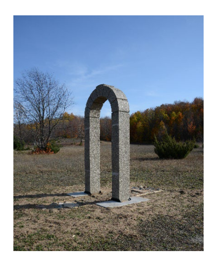
If you stand under the arch and make a sound, you will hear an echo, even though the arch is relatively narrow.