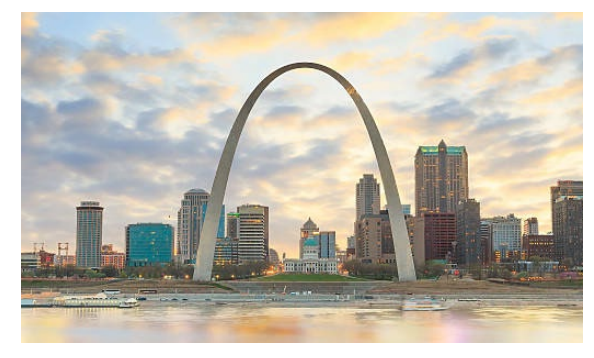
The arch's two legs were built separately, and if their measurements were off by as little as 1/64th of an inch, they would not have been able to join at the top.

The St. Louis Gateway Arch is a catenary arch. It opened in 1965 as a 630-foot-tall monument to Thomas Jefferson and America's westward expansion. The St. Louis Arch is just as wide as it is tall!