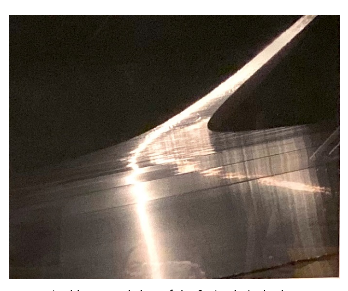
In this unusual view of the St. Louis Arch, the windows at the top of the arch are barely visible in the upper right corner.