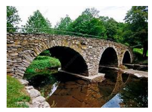
For thousands of years, stone arch bridges have carried roads across rivers. Ours won't be a stone bridge, but the Conservation Resource Alliance is working to replace the culvert here at Deer Creek.

Arches in brick architecture appeared in Mesopotamia over 3000 years ago, but the ancient Romans were the first to really apply the technology of arches. To cross a river or a valley, arches provided support for bridges and aqueducts, allowing for transport of people on roads and water in aqueducts over great distances.