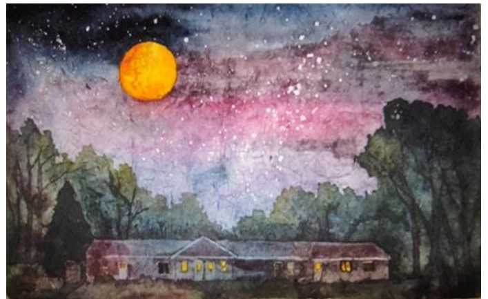
There is an inherent softness about rice paper batiks, both in the look of the artwork and the actual feel of the rice paper.