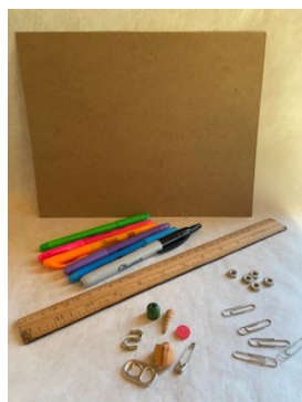
1 Gather materials

Tic-tac-toe is a game for two players, X and O, who take turns marking the spaces in a 3x3 grid. The player who succeeds in placing three of their markers in a horizontal, vertical, or diagonal row wins the game. Make your own game of Tic Tac Toe. Use paper or cardboard to draw a “board” that you can reuse. Draw 2 vertical lines and 2 horizontal lines to make the game board. Make your board plain or add color and design to make it special! Find two different kinds of objects to use for game pieces or markers. You will need 5 pieces of each object. You can use two different colors or kinds of buttons or two different coins or look for nuts or washers in the tool box. If you feel like going for a walk, find 5 light colored small rocks and 5 dark colored small rocks. Keep these with your game board, so that you can play now and later. Tic-Tac-Toe game is also called Noughts (another word for “O”) and Crosses (“X”) by the British and was even played in ancient Egypt 3300 years ago. If you want to change things up, play the game, but try to make the other person win, so the loser becomes the winner! Have fun and find a safe place to store your game for future play.