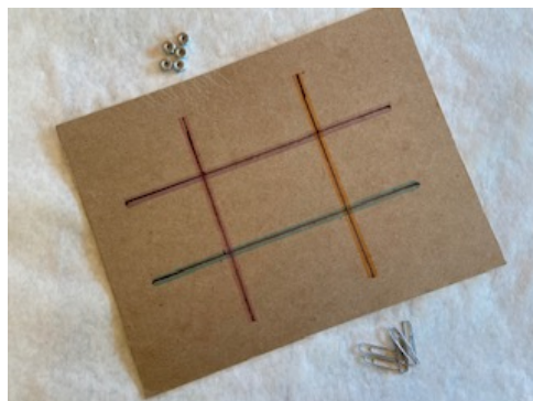
2 Make your game board