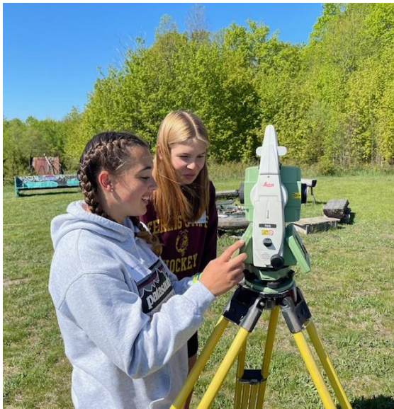
A surveying career may appeal to students. Surveyors work in a variety of settings, play a crucial role in planning, utilize advanced technology; engage in complex problem-solving; AND surveyors are in consistent demand!

Tuesday and Wednesday of this past week, Raven Hill hosted its 30 th Non-traditional Science/Mathematics Career Expo for middle school students. Sponsored by Charlevoix-Emmet Intermediate School District (Char-Em ISD) since 1993, the hands-on career sessions give students a “real” feel for a variety of careers.