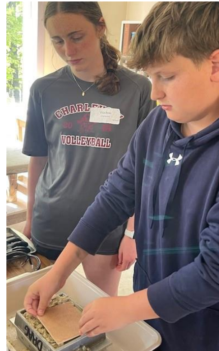
Students pack sand in preparation for casting. Engineering as a career can be exciting! Engineers tackle complex problems and create innovative solutions. They collaborate, work in diverse fields, impact society and are at the forefront of technology. Engineering skills are in demand worldwide, plus there is strong job stability.

This year, career presentations included culinary arts, surveying, forestry, physical therapy, 3D printing, emergency medical services, alternative energy, musician, engineering and fisheries. About 150 students from Emmet, Charlevoix and Northern Antrim