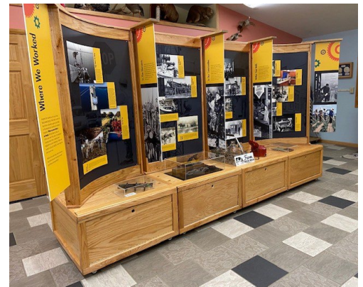
"Where we worked" panel of Labor Days—A History of Work