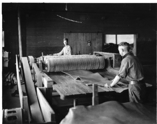
At work in the Tannery