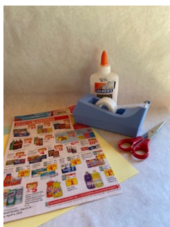
1. Gather supplies

Note: Start saving empty boxes, paper towel and TP rolls for a "robot". Curled strips will make great "hair"!!