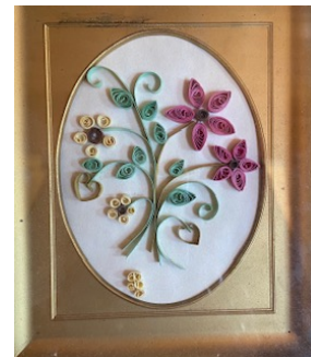
4. Quill art

Enjoy and be sure to put all your supplies away, when you are done.