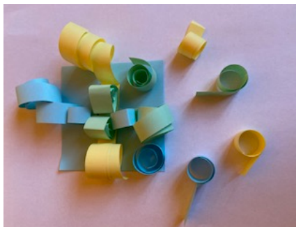
3. Create a design