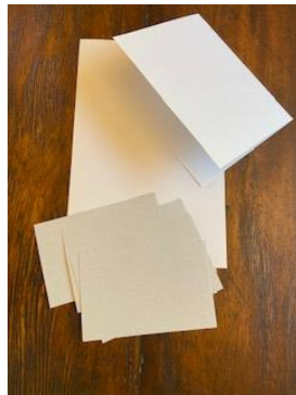
2 Cut cardstock & drawing paper