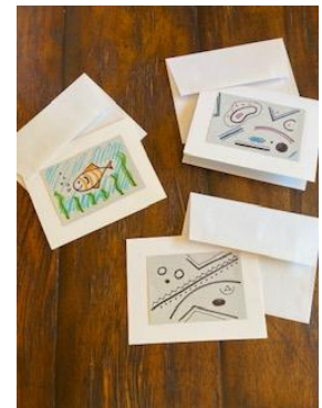
4 Sample cards