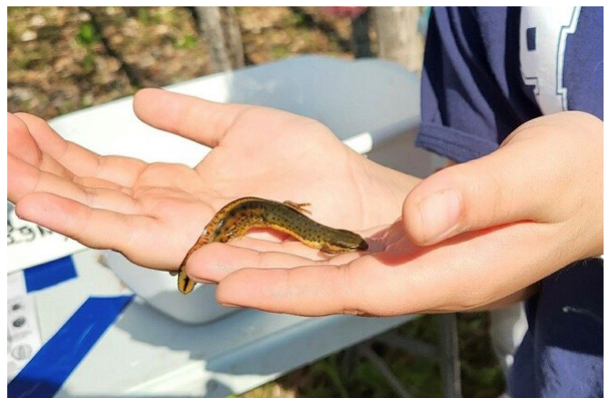
Students used nets to collect and identify the diverse specimens inhabiting Raven Hill's pond, including a significant population of salamanders.

Spring is a great time to visit the Center. Raven Hill is open weekends—noon to 4pm on Saturdays; 2pm to 4pm on Sundays, as well as holidays and other times by appointment. We are often hosting field trip groups this time of year and welcome families to come explore at the same time! Summer Classes for Kids start June 12 and continue weekly to August 24 with classes in science, history or the arts available each week. There are still openings, so sign your kids up soon. You might also consider booking a science, history or art class for friends or family any time of the year. Classes are appropriate and FUN for most ages. Plus, the Center is a perfect place for scout and 4H activities, birthday parties for youngsters & adults, retreats, weddings and other gatherings.