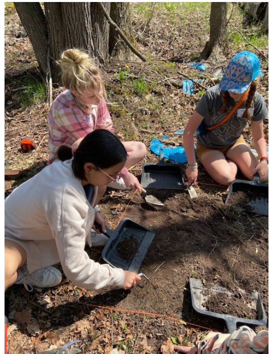
Over the years, middle school students have unearthed over 250 artifacts during the career expos. Bricks, bolts and nails were added to the collection by this year's students.

This year careers included archeology, water quality, surveying, forestry, equestrian trainer, nursing, physical therapy, 3D printing, emergency medical services, alternative energy, butterfly ecology and fisheries.