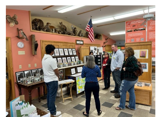
Exciting and inspirational conversations happened multiple times between the communities' leaders, students, teachers, administrators and Smithsonian staff.

Last fall, Raven Hill Discovery Center was selected to participate as one of two organizations nationwide in the Smithsonian's Youth Innovation in Rural America ( YIRA ) initiative. An open house on Saturday, May 6 showcased students' projects. The program was a collaboration between the Smithsonian, local teachers, youth, Raven Hill, and Charlevoix-Emmet Intermediate School District. Participants used the innovation design process in their local communities. Through this project, youth engaged in thoughtful conversations with their communities, drew from their own history and local culture, worked to identify opportunities, and proposed positive change within their communities. Nine