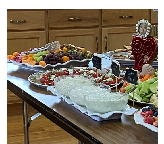
Guests enjoyed food provided by East Jordan's Yum & Yummer and students from Boyne City Hospitality class, who showed off their culinary arts skills. The two groups collaborated on a wide range of sweet and savory for the open house.