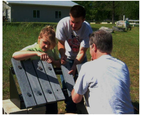
In the compound word "lithophone", the word "phone" comes from the Greek word for "sound" and "litho" means "stone". Who knew?!