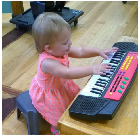
This aspiring musician takes delight in the keyboard. Now may be just the time for you to pick up an instrument & learn something new.

The sounds of music exist inside & out at Raven Hill. Music continually exemplifies the Center’s mission to enhance hands-on and lifelong learning for all ages by connecting science, history and the arts. The marimba, a type of xylophone, is a perfect example of those connections. The instrument has its roots in 14 th century Africa. The beautifully woodworked keys are struck with mallets to create wonderfully soft and mellow musical tones. The different notes are dependent on such things as the thickness and density of the wood. The marimba keys have a kerf carved underneath in the middle. The vibrations have to slow down & squeeze through the thinner middle part of the bar, thus lowering the pitch...science, history and art.