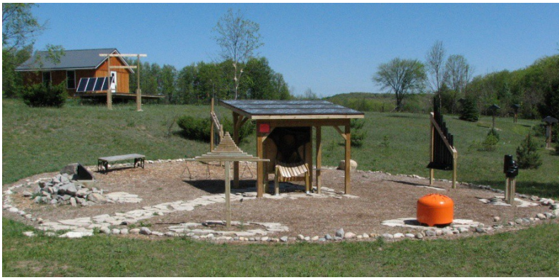
For most of 2020, the Earth Tones Music Garden has remained silent, save for a few summer visitors exploring the grounds.