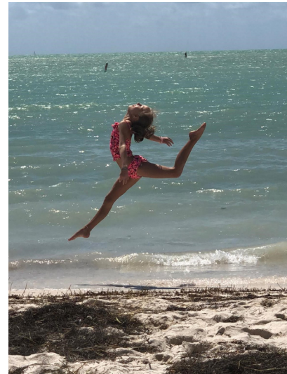
Dances with Water.

Please make your check payable to Raven Hill Discovery Center, 4737 Fuller Road, East Jordan, MI 49727. All gifts are tax deductible to the fullest extent provided by law.