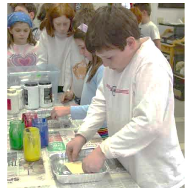
Science of liquid density