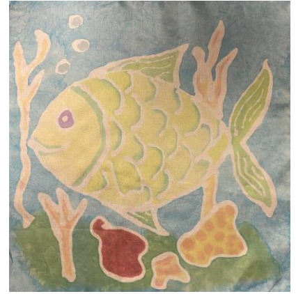
Modern form of ancient resist-dye