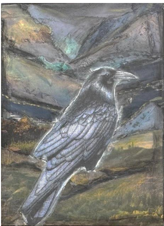
By artist Gayle Levengood