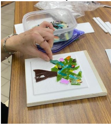
Molded by time & temperature with elemental color exploration

Designed for youth ages 12 to 14 to CREATE , this program invites participants to dive into the world of inventions, innovations, and discover the creator within. Held on Saturdays from noon to 2 PM, the program encourages hands-on exploration—building bridges, sculptures, and simple machines; crafting art from natural and recycled materials; and experimenting with traditional art forms from around the world. Tuition is free in June, July, and August, again thanks to support from the Smithsonian Museum on Main Street (MoMS) and the Cooper Hewitt, Smithsonian Design Museum. It's a perfect opportunity for young creators to imagine, design, and build!