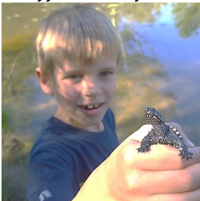
Exploring pond populations

Summer Adventure Classes for Kids (SACK) is a fun and flexible