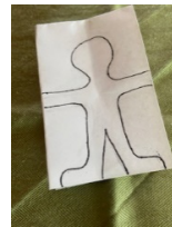
4 Draw figure