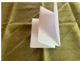
3 Fold accordion style