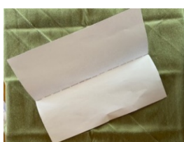
2 Fold paper lengthwise