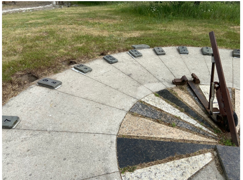
These engraved bluestones will be set flush in the ground outside the cement circle! That will make for easy mowing! Visitors can read the time by the sun's shadow in both Daylight Savings Time and Eastern Standard Time! The original sundial was created by Leadership Little Traverse in 2010.