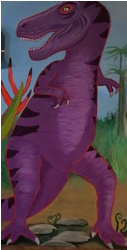
You'll just have to wait to see this T-Rex and all his friends, when the Dino Height Station is done and ready for you to compare your height to "pre-teen" (half-size) dinosaurs!