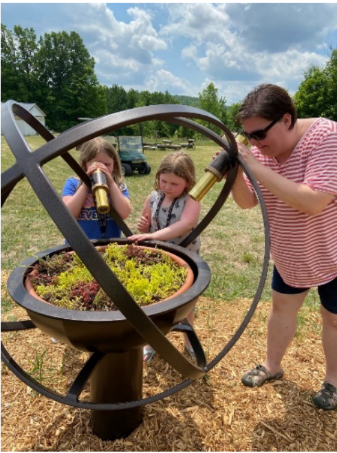
By Friday afternoon, a family was already checking out the wonderful kaleidoscopic designs made by spinning the dish garden. Be sure you see it when you come next.