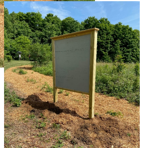
The Connections panels are up! Next step is giving them a colorful coating of paint and adding items to make them ready for hands-on learning.