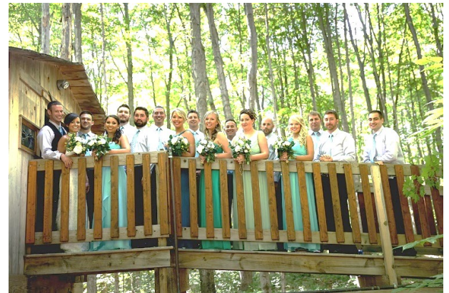
If you are looking for a unique wedding venue, Raven Hill is the place.

Think about Raven Hill as a venue for the coming holidays and for 2023. Book the Great Room for a holiday party. Consider the Center for your next company retreat. Arrange a birthday party - adult or child. Book a wedding, a wedding shower or reception. Plan your next family reunion. Raven Hill Discovery Center is a great location for families, staff or friends.