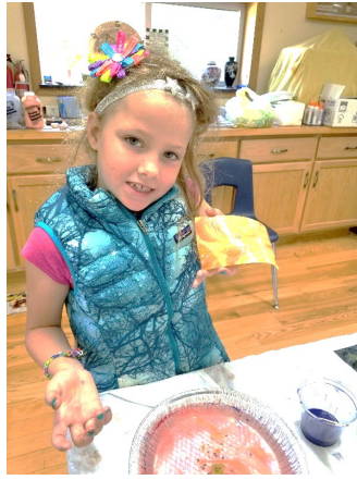
Marbled paper is fun and easy for all ages! The beautiful paper can be used to decorate notecards. The unique paper can also be cut into shapes like Christmas trees and stars for special bookmarks and ornaments.