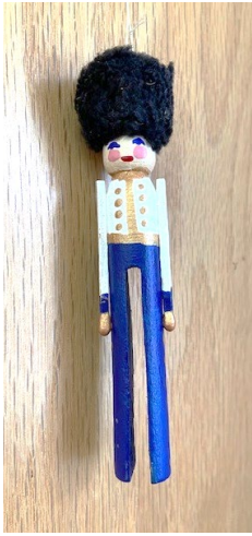
The Nutcracker soldier originates from late-17th century Germany. They were given as gifts to bring luck to the family and protect the home.