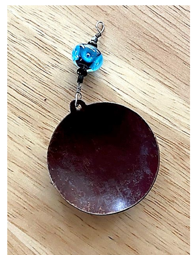
(Left) If there is a bird lover, in your midst, fused glass is a great way to honor that interest, as evidenced by this funky chicken! (Middle) French Serti uses a resist to draw a design, before the dyes are added to the silk. (Right) Copper discs can be polished or pounded into simple shapes and used as an ornament or a pendant. Add a handmade Raven Hill glass bead at the top of the pendant to make it a special gift for someone.