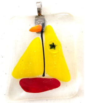
Think summer and create a fused glass ornament to gift to your favorite sailor.

Think about Raven Hill as a venue for the coming holidays and for 2023. Book the Great Room for a holiday party. Consider the Center for your next company retreat. Arrange a birthday party - adult or child. Book a wedding, a wedding shower or reception. Plan your next family reunion. Raven Hill Discovery Center is a great location for families, staff or friends.