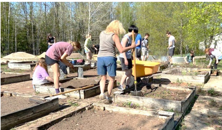
Alanson's Agri-Science class donates their time every spring to spruce up Raven Hill for summer visitors. They work hard weeding and pruning. Afterwards, the Center treats them to a lunch of pizza and pop!

Alternatively, keep Raven Hill in mind. Volunteer your time: pull weeds; clean a building; wash windows or use your computer and organizational skills to help.