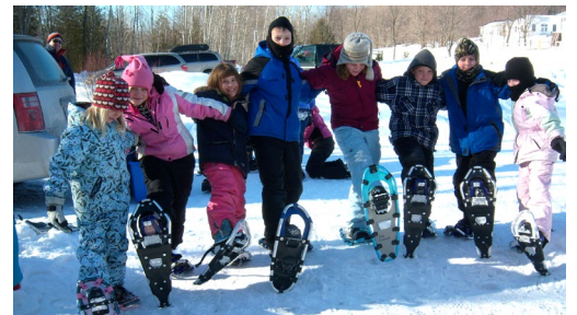
Winter, summer, spring or fall—there's always something to do at Raven Hill!

PS See more art classes below! Celebrate Raven Hill and create some special art of your own! Call 231.536.3369 soon to schedule a class for you or your entire family!