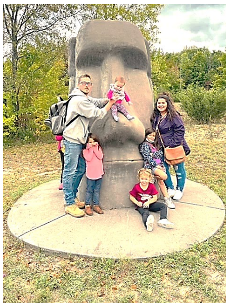
Raven Hill is a great place for families to spend quality time together.

I love thee with a passion to ensure that you live on beyond me. I do so by supporting you financially now through a membership or donation and into the future through planned giving.