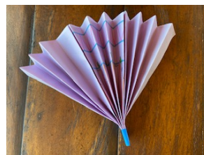
7 Use your fan