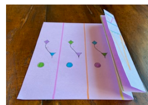
4 Repeat step #3