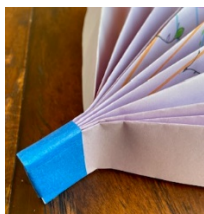
6 Tape one end