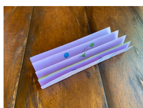
5 Repeat step #3