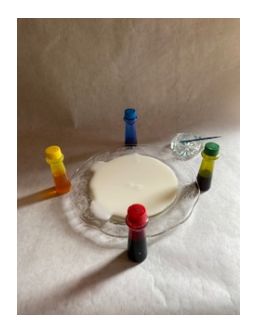
2 Add food coloring