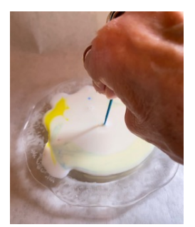
3 Put soap on toothpick 4. Watch the swirls