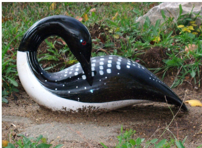
Look for the loon sculpture in Raven Hill's Exploring Beyond Jurassic Park outdoor walkway! You'll find the loon near Archaeopteryx , a bird-like creature from 150 million years ago that had teeth, wings and feathers. Wood sculpture by unknown artist