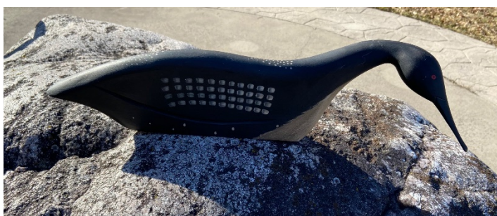
In Native American mythology, Raven gives us the sun, moon and stars, while Loon plays the role of Earth-Diver. Legend says that Loon is the only animal to succeed at diving to the ocean floor to bring up earth for the Creator to use for making land. Wood sculpture by J. Dudley, The Boyds Collection

Loons belong to the group or clade Aequorlornithes, along with other water birds like flamingos, grebes, shorebirds, penguins, pelicans, herons and storks. Loons are in the order Gaviiformes and they appeared over 40 million years ago.