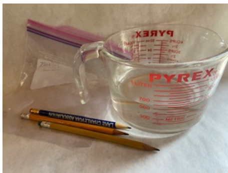
1 Gather supplies

Have you ever jumped into the water and felt the pressure on your ears, when you went deep down? Water exerts pressure, which is logical, BUT can also be fun! This is best done over the sink. Fill a Ziploc plastic bag almost full with water and seal. Careful, it will be heavy. Holding it over the sink, slowly and carefully push a pencil through one side of the bag and out the other at an angle, so the holes are not straight across from each other. Surprise: no water comes out! Push another pencil in and out at also a different angle and then add a third pencil. How many holes do you now have in the bag? Holding the bag OVER THE SINK, pull all three pencils out as fast as possible. Notice that the water coming out the top holes don't shoot out very far, compared to the water shooting out much further from the lowest or bottom hole. There's more water pressing down on the water at the bottom of the bag, so it shoots out further!