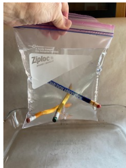
2. Fill bag & push pencils thru