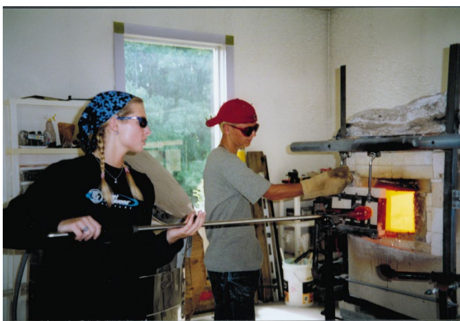
Glass blowing takes teamwork

Glass classes at Raven Hill, both for kids and adults, were and still are a favorite. At one point, back in 2005, the Print Shop was being used as a glass studio. Complete with a glass furnace, students made paper weights and glass cylinders, learning to how to control the molten glass and how to use color & design. Stained glass classes were another favorite, as beginning students learned to apply the copper foil and then solder the pieces together in a “four square”. From there, students advanced to larger pieces and even 3d stained glass pieces. Eventually, the focus turned to flame working and making glass beads with Tim. During the school year and all summer long, staff and students would sit by the hour, making beads of all colors and shapes. Now, the Print Shop is being restored to an actual Print Shop and most of the glass classes are limited to fused and slumped glass, which are done in the main building: Glass on a Cart! Still fun to see the outcome!