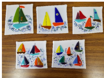
Fused glass trophies for 5k run