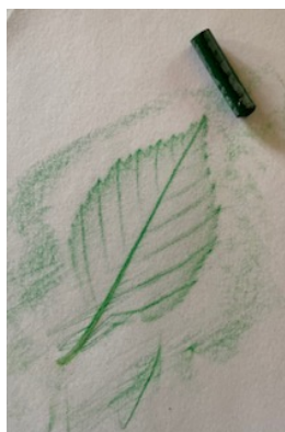
2 Leaf & crayon