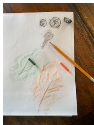
3 Leaves, coins, key