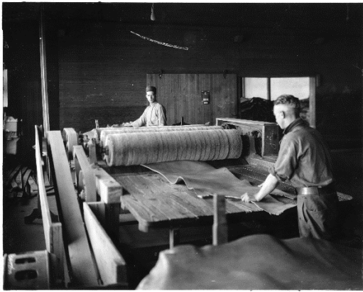
At work in the Tannery