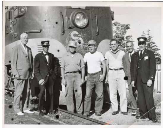
Different jobs | Different uniforms