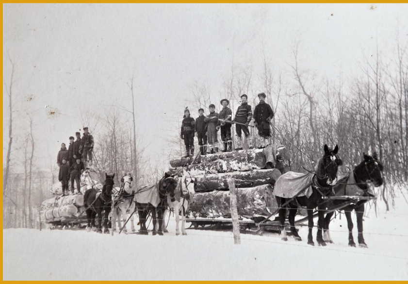
Exhibit Open Daily 10 am to 4 pm

SATURDAY, AUGUST 14 TO WEDNESDAY, SEPTEMBER 30, 2021 (NOTE: DATE CHANGED FROM 2020)