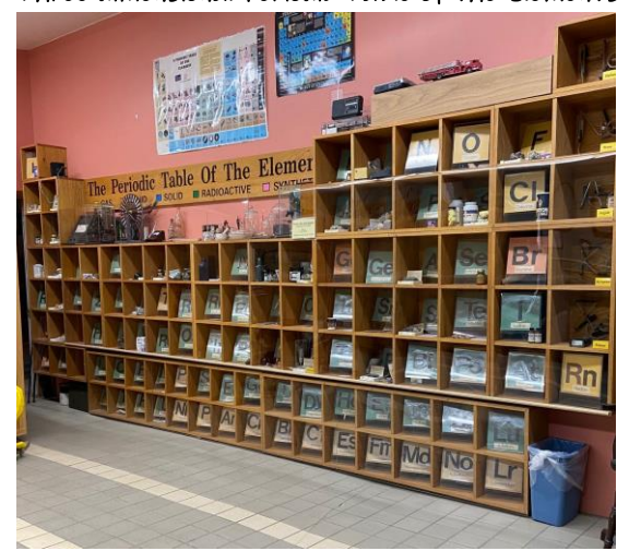
Each element on the Periodic Table has its own 12" cubical box that contains the element's symbol, the element as it comes from the earth, and products containing that element.