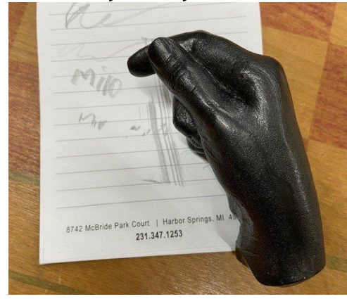
Graphite contains the element Carbon and is the "lead" in pencils. This hand is sculpted from graphite & paraffin, so you can actually write with the hand itself.