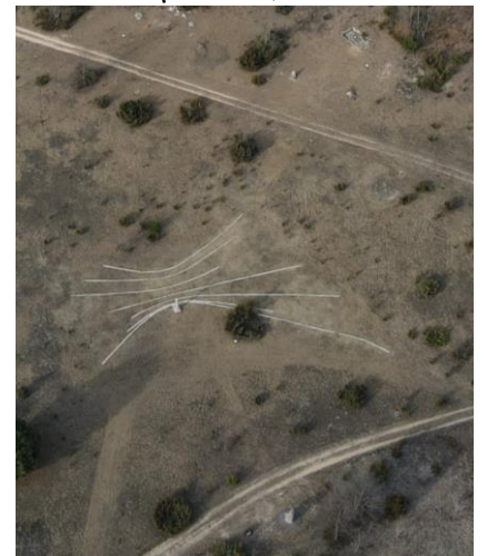
An aerial view of the Obelisk shows the arcs to the south in the summer, when the sun is in the north and arcs to the north in the winter, when the sun is in the south. The straight line in the middle represents the two equinoxes.