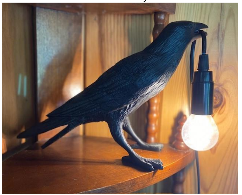
Ravens symbolize intelligence, curiosity, transformation and are capable of complex problem-solving. Lightbulbs represent innovation, ideas, enlightenment and are a common symbol for a moment of insight or a new idea. A raven holding a lightbulb symbolizes the act of gaining wisdom and insight. The raven, already a symbol of intelligence, is illuminated by the lightbulb, representing the transformative power of innovative ideas. Once the raven (or the mind) has grasped the lightbulb (a new idea), it is forever changed, enlightened and expanded and can never revert to its former, more limited state.

Raven Hill Discovery Center embodies the essence of Einstein's quote by providing experiences that open minds to innovative ideas, leads to intellectual growth and offers a broader, more enriched perspective on the world for all visitors. This mindset of continuous learning and innovation supports the idea that an open mind is always growing and evolving.