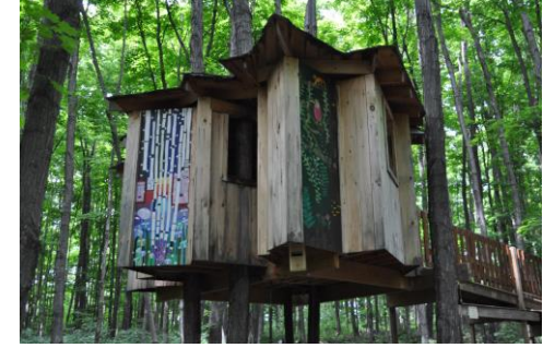
The Treehouse is built in the shape of a maple leaf. Visitors are challenged to think about whether that leaf is from a red or sugar maple tree.

Raven Hill Treehouse—only one of its kind!