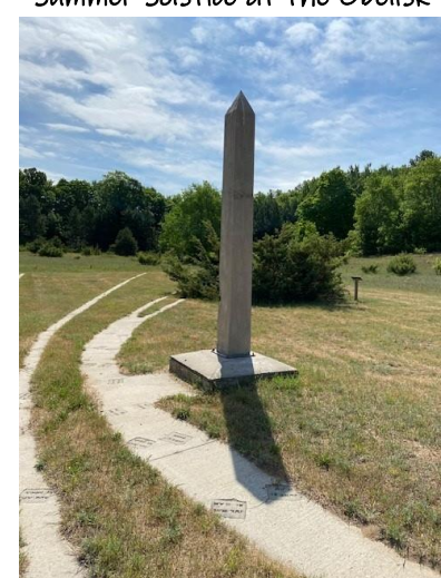
The arcs close to the Obelisk are the summer months and arc to the south because the sun is in the north.