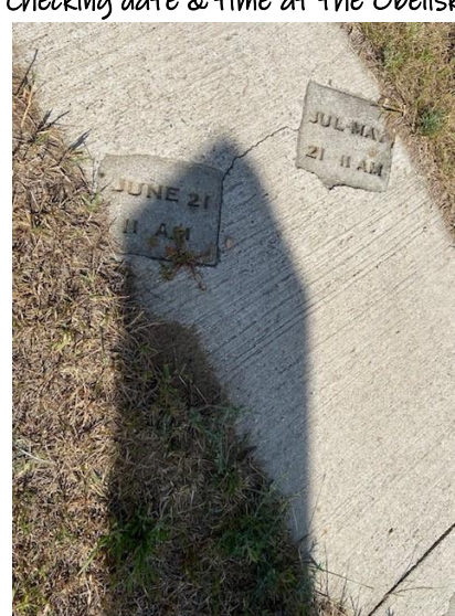
Pictured above is a closeup of the shadow at 11am on June 21st.

Another example is the Obelisk in the Ancient World where visitors actively engage and internalize ideas & concepts in a way that permanently expands their horizons. The Obelisk serves as a powerful educational tool, broadening visitor perspectives in several ways by illustrating the cyclic nature of time and highlighting the knowledge of ancient civilizations. The changing shadows of the Obelisk help visitors visualize the cyclic nature of both the day and the year. This tangible representation of time's passage deepens their understanding of natural rhythms and astronomical cycles, which are fundamental concepts in both science and history. By recognizing that ancient civilizations used similar methods to track time, visitors can appreciate the ingenuity and observational skills of early civilizations. This connection fosters a greater respect for ancient cultures and their contributions to our understanding of the world.