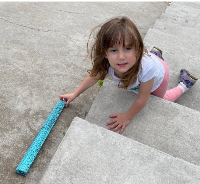
This bright blue Egyptian royal cubit replica has hieroglyphics all over it! It is easy to use and is available to check out and use here at Raven Hill. Or, you always have your cubit with you ready to use!

Here at Raven Hill, Emily used a royal cubit (21 inches) to measure the Pyramid out in the Center's Ancient World. The Egyptians would tie knots in a long rope at "cubit" intervals. That way, they could stretch out the rope and count the cubits or knots to easily determine a longer distance.