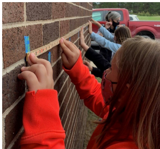
Pellston fourth graders are using a carpenter rule to measure the length of the brick wall. These folding or zigzag rulers have been used since the mid-1800's. Do you remember your Grandfather using one?

I use cubits a lot. I'm always measuring Checkers, the corn snake, in cubits. Checkers is greater than two cubits. At home, when I am rearranging the furniture, I can use my cubit to determine if the couch will fit in a new space easily, if the couch is too long OR if it's close and I probably should go find a measuring tape!