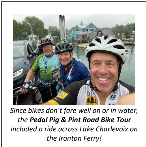
Since bikes don't fare well on or in water, the Pedal Pig & Pint Road Bike Tour included a ride across Lake Charlevoix on the Ironton Ferry!

First, the 4 th annual Pedal Pig and Pint Bike Tour event took place on Sunday, August 7 th . Despite uncertain weather, a cadre of hearty bikers took to the roads and trails around Boyne to ride in support of Raven Hill Discovery Center and Top Of Michigan Mountain Bike Association. Everyone met at Stiggs Brewery afterwards for a celebratory lunch.