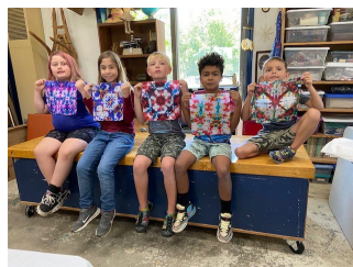
The directions were all the same, but the results were SO individual. Everyone folded, clipped, designed & colored their silk handkerchief, as they wanted for Shibori! What beautiful results!