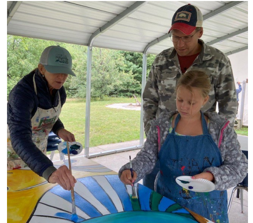
Mural painting participants will be able to view their handiwork soon at Raven Hill!

Summer hours are in effect until Labor Day weekend. Raven Hill is open weekdays from 10am to 4pm through Friday, September 2 nd . Starting Saturday, September 3 rd , Raven Hill will be open weekends—noon to 4pm on Saturdays; 2pm to 4pm on Sundays and other times by appointment. Call 231.536.3369 or email info@miravenhill.org to make reservations for any time you would like to visit, including special occasions and major holidays.