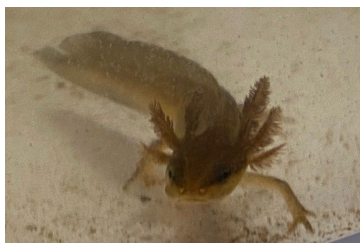
This salamander larva was a surprise catch, as campers were froggin' around!