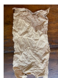
5 Repeat #3 & #4 'til soft