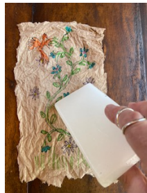
8 Coat with wax