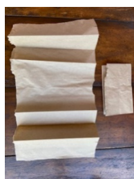
2 Open lunch sack