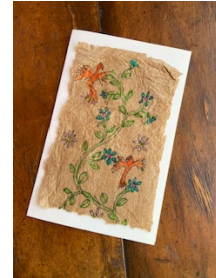
11 Frame or make card