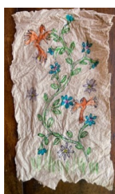
7 Outline all in black