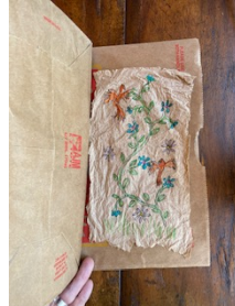
9 Put between grocery sack