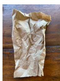
4 Open up sack