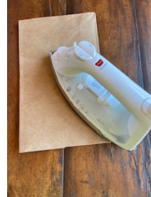
10 Iron to melt wax