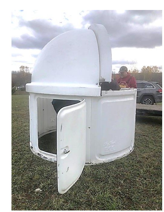
Clear skies are the final ingredient needed for the observatory to be activated and ready for a new generation of sky watchers!

231.536.3369 to let us know of your interest. Raven Hill continues to expand its exhibitions, encouraging visitors to add to the depth and breadth of their own understanding of science, history and the arts.