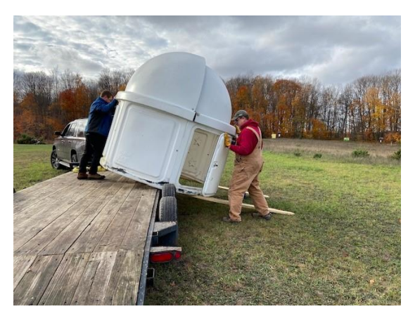
Never has a project gone so smoothly. The observatory slid off the trailer to its new location. Not only was the landing site perfectly level, there was not one single rock hit as rods were pounded into the ground to secure the dome.

We encourage you to explore the depth and breadth of Raven Hill. Come walk Dylan's Dock at the Pond or let us know if you are interested in learning how to use the telescope to "read" the night skies. We are looking for those people who want to enjoy the breadth of our natural environment, as well as those who want to "drill down" and learn in depth the proper operation and workings of the telescope. Please email <a href="mailto:info@miravenhill.org">info@miravenhill.org</a> or call Cheri at