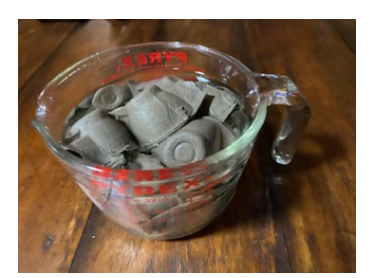
3 Soak in water