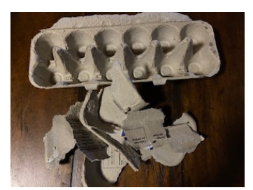
2 Tear carton to pieces