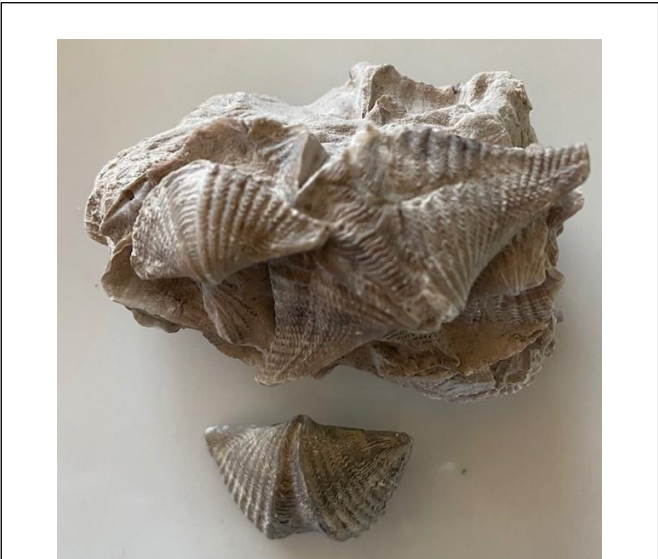
Petoskey corals are not the only fossils to be found in Michigan. The coral reefs that were here 500 to 300 million years ago provide lots of fossil hunting adventures for us today. If you are a hunter of fossils, you may find brachiopods like these or you can visit our Under Michigan & Beyond exhibit with all its fossils!