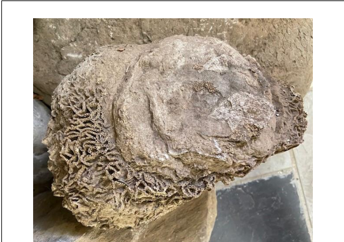
Chain corals lived here 443 to 419 million years ago, when Michigan was covered in a warm, shallow sea. What an adventure it is to find a chain coral fossil! Try your hand at fossil hunting, you'll like it! Remember to look for this chain coral fossil when you come to see Raven Hill's upcoming exhibit, Under Michigan & Beyond .