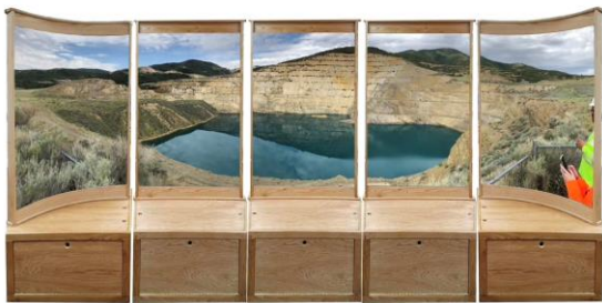
Mock-up of Barney's Canyon Gold Mine, one section of the coming Under Michigan & Beyond exhibition. More to come!

Third, be sure to visit on Saturday, May 25 from noon to 4pm for the Grand Opening of Raven Hill's Under Michigan & Beyond exhibition. This interactive and ever-evolving display of rocks and minerals from Michigan and around the world will engage and excite all ages. Prepare to be transported on a journey beneath the Earth's surface. Delve into the fascinating realm of rocks and minerals, from the depths of Michigan and Earth's exotic locales worldwide and how Earth's resources are used in our daily lives. Discover the hidden treasures of our planet and uncover their incredible stories. Don't miss this extraordinary interactive and ever-evolving adventure! Under Michigan & Beyond opens May 25 and will remain open through the end of 2025, so you can get involved in new rock & mineral adventures time and again right here at Raven Hill.