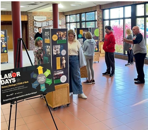
At last, Raven Hill's HHS towers have begun their journey across northern Michigan, sharing all six Michigan Career Pathways with its audiences! How many friends and neighbors might you recognize?