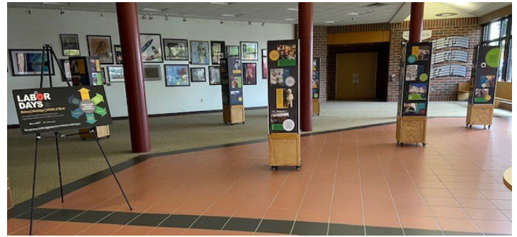
History Heritage & STEAM is equally at home in libraries, lobbies, reception areas or in foyers, as shown here outside the East Jordan Community Auditorium.

The State of Michigan has developed six Career Pathways , which are designed to help K-12 students explore a variety of vocations, including Arts & Communication; Business Management, Marketing & Technology; Health Sciences; Natural Resources & Agriscience; Human Services; as well as Engineering/Manufacturing & Industrial Technology. These Career Pathways provide the overall organizational structure for Raven Hill's HHS traveling exhibit.