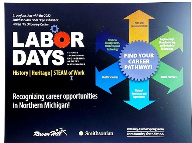
Career Pathways include careers that are grouped together, because they are similar. Which Career Pathway do you choose? Now, here's a challenge for you: can you name a career that connects science, history & art AND meets Raven Hill's mission?!