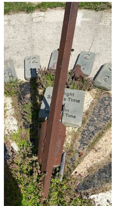
Re-purposed metal was used to make our style or gnomon. Granite wedges were cut & donated by Petoskey Granite & Quartz Countertops to form the platform. The gnomon casts a shadow onto the platform, which is marked with bluestones showing the different hours of daylight.