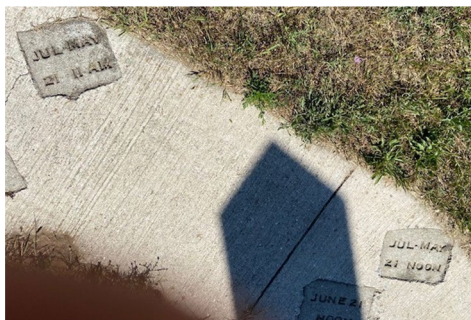
The Egyptian pharaohs and scribes used obelisks to look powerful. They understood that the length of the shadows indicated the months of the year. The commoners knew that the tip of the obelisk's shadow was a way to measure their work hours. The shadow above reads approximately 11:45am on July 23 rd , just before the Center opened yesterday!

Ancient Egyptians also used obelisks as sundials. Raven Hill's Ancient World has an obelisk, which creates a shadow marking both the time AND the date! Our obelisk was built in 2006.