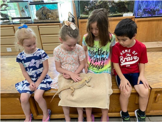
These cousins came from southern Michigan and Hawaii to visit Raven Hill. They took turns holding Spike, the bearded dragon. If Spike was living wild in your backyard, you would be living in Australia with the kangaroos!