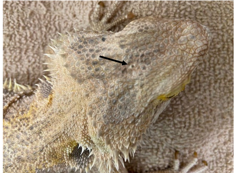
Look for the small black dot in a light colored oval at the tip of the arrow above. Many lizards, including Spike, have a third eye. A lizard's third eye is called a pineal, parietal, or solar eye. This third eye has a retina and lens, but no iris, which is why it looks different from the other two eyes.

The eye is on the top of the head acts as a shadow-sensor and allows the lizard to escape quickly, whenever a shadow is detected. "It is better to be safe than to be lunch for a predator."