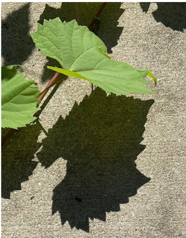
This grape leaf is following Helen Keller's advice: "Keep your face to the sunshine and you cannot see a shadow."