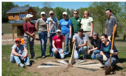
In 2010, Leadership Little Traverse participants built this sundial at Raven Hill. You can tell the time, whenever there is enough sun to create a shadow. For fun, we planted the herb, thyme, around the sundial.