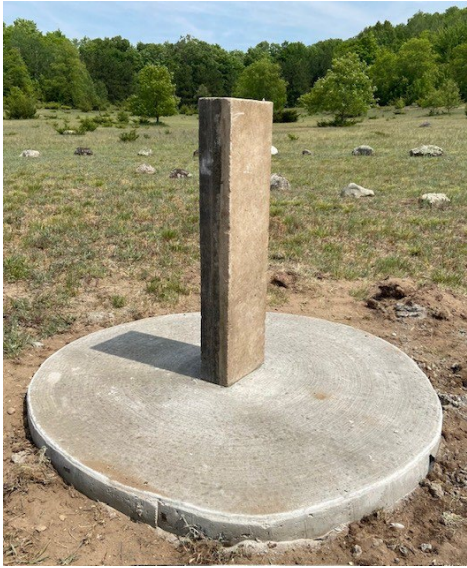
Now, the Altar Stone at Raven Hill stands vertically welcoming positive energy to the Center's many visitors.

For years, the Altar of Raven Hill's Stonehenge has laid on the ground for fear of someone knocking it over and getting hurt. Now it is secure in a vertical position. The actual Altar Stone at England's Stonehenge is partially buried beneath two of the fallen stones of the largest trilithon. No one knows, whether it originally lay flat as an altar-like slab or if it stood upright. At Raven Hill, the vertical positioning of the Altar Stone lends itself to greater visibility, making it all the more impressive. In England and at the Center, the Altar Stone faces in a northeast direction, marking the midsummer sunrise, an important part in the cycle of life for prehistoric cultures. As described in Vastu shastra, a traditional Indian architecture that is based on the principles of design that brings harmony with nature, a northeast direction ensures wealth, prosperity and happiness. Many prehistoric civilizations, like Vastu Shastra and the ancient Chinese Feng shui, use energy forces to harmonize people with their environment.